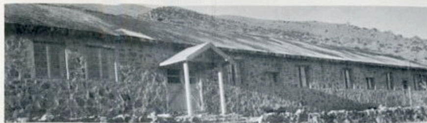
#162 Blue Bird Christian Farm Home

About 365 native missionary families are now supported while starting new pioneer churches. They are assisted for a period of two years.