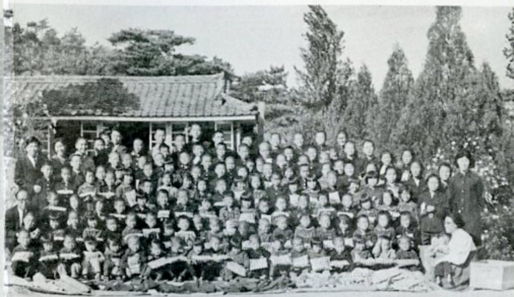
Thanks to many generous sponsors who supplied the WARM funds, the children of the Loving Light Orphanage will be warm and snug during the bitter Korean winter. Just look at the stacks of WARM clothing ready to protect little bodies from the bitter winter winds.

Today, during the coldest part of the winter season, thousands of boys and girls in Compassion orphanages are protected from the freezing weather because they received WARM winter outfits. This was made possible through the sacrificial gifts of many Compassion sponsors and friends. To each one who had a part in providing snug winter clothing for the precious children in the orphanages we say — THANK YOU!