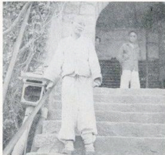
A poor emaciated, blind leper leaves the church on the Colony. The children are taken from these parents at their request, so that they do not contract the disease.

4. Please do not send money to Korea for your child's support or as a special gift. It is illegal for the Superintendent to have American money. He must send it back to you. All support money must be sent to our Chicago office. If you want to buy something special for your child, but cannot get to a store or the Post Office, then order it from Sears, Roebuck & Co. They will send it directly to Korea.