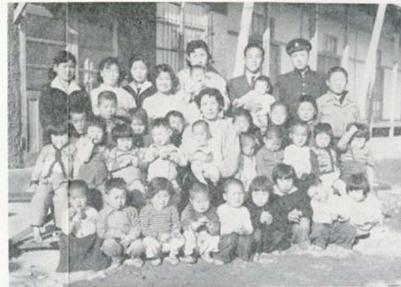
This is ETERNAL LIFE ORPHANAGE, one of the new ones we have begun to support, but without one sponsor yet. Will you sponsor one of these dear children?

A Michigan Pastor writes: "Thank you for ministering to us. The meetings were far more than I had expected. The blessings were great for me, and our people were blessed abundantly. We shall remember