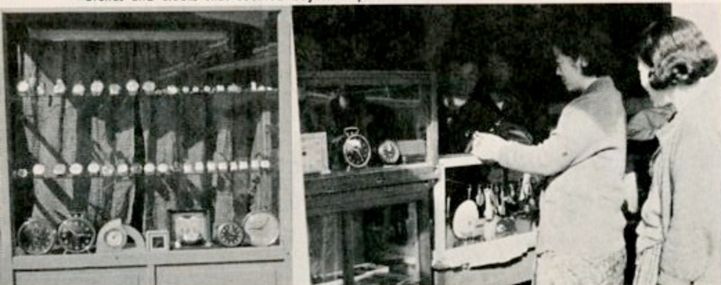
After the timepieces were repaired they were offered for sale to local townspeople. They were quickly sold and extra funds provided for the orphanage.