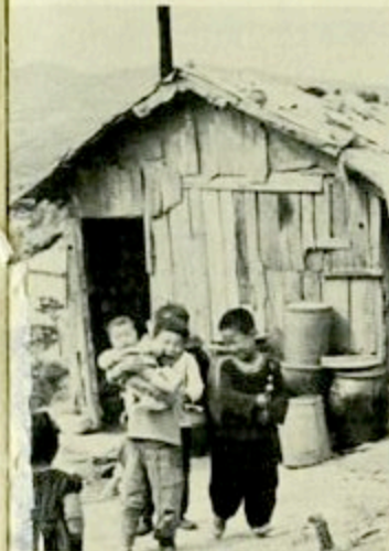
These poor children live in makeshift shack.

Today the United States of America is riding the greatest wave of prosperity it has ever known. The needs of the world grow dim in the light of our own well being. Yet, there are desperate needs to be met. There are precious souls — helpless and homeless boys and girls — crying for the love and compassion that a sponsor can give. The Lord Jesus Christ would have us reach out and minister to the needs of these boys and girls with all the means at our disposal.