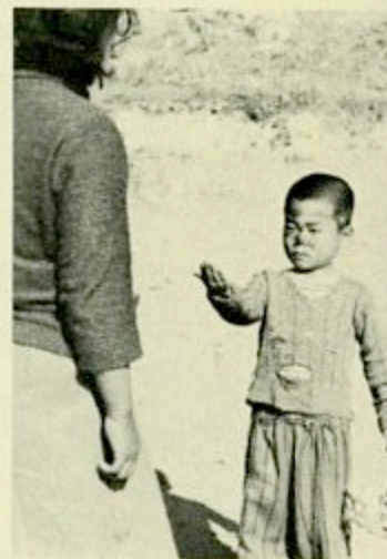
Beggar boy asking for a few grains of rice.

Today the United States of America is riding the greatest wave of prosperity it has ever known. The needs of the world grow dim in the light of our own well being. Yet, there are desperate needs to be met. There are precious souls — helpless and homeless boys and girls — crying for the love and compassion that a sponsor can give. The Lord Jesus Christ would have us reach out and minister to the needs of these boys and girls with all the means at our disposal.