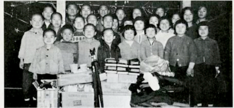
The children at Chinju Faith and Love Orphanage celebrated Christmas together last year, just like one big, happy family. COMPASSION sponsors made this possible.

In COMPASSION Homes in Korea every effort is made to make Christmas a happy and meaningful time for the children. They sing together, read the Bible, and play games. They also receive gifts, just like the children in America. Each orphanage superintendent does his very best to make Christmas a blessed time for all the children.