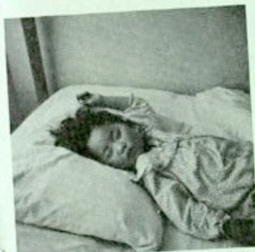
Without proper care she might die