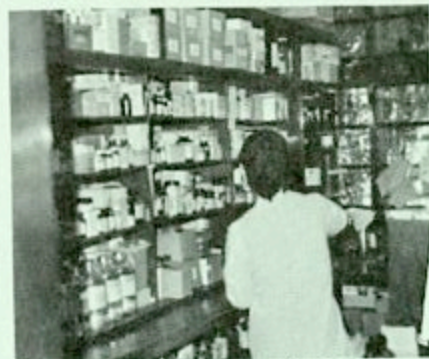
Modern medicines are supplied by sponsors