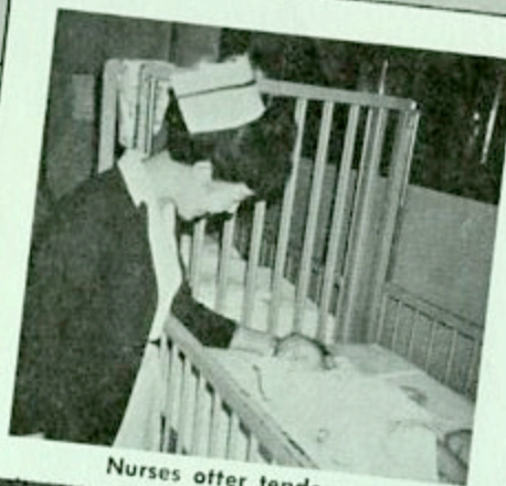
Nurses offer tender care