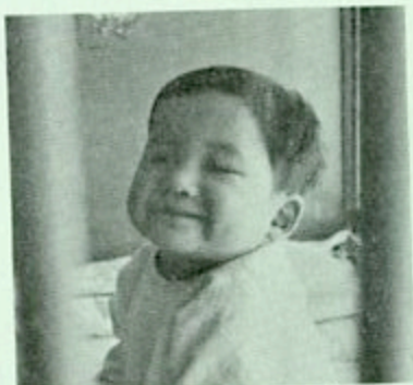
Sick but able to smile