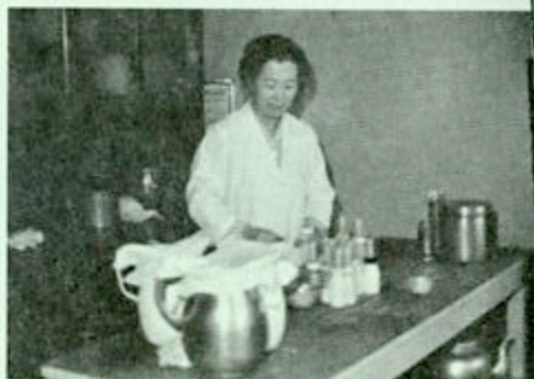
Baby care is important