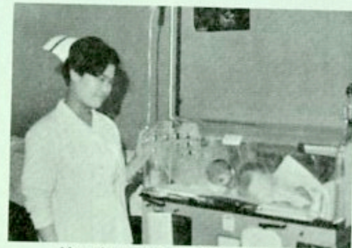
Abandoned infant just few days old

COMPASSION is a ministry of joy! Caring for precious children, bringing love and happiness into their lives, helping them become strong, substantial men and women—these are the joys of sponsorship. But, there is more.