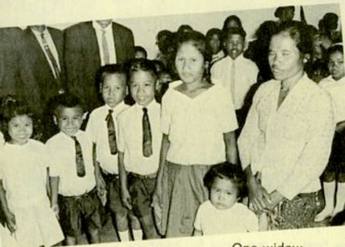
One widow and 6 children in Sumatra.