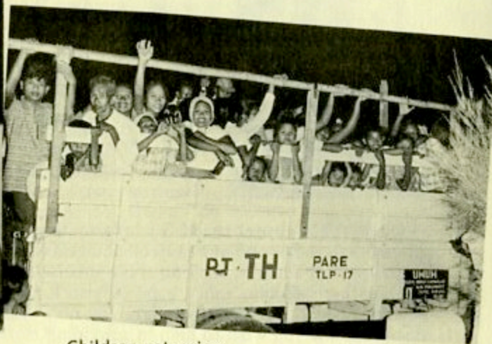
Children returning to rubber plantation after COMPASSION service.