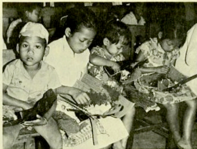
They came so far that 500 ate rice after church.