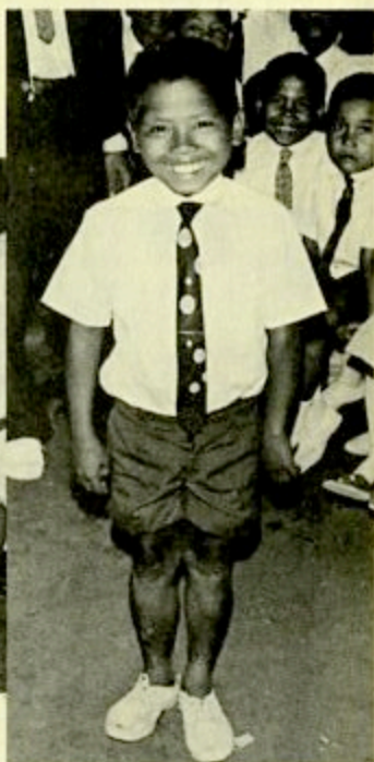
All dressed up with new clothes and smiles to greet COMPASSION's President.