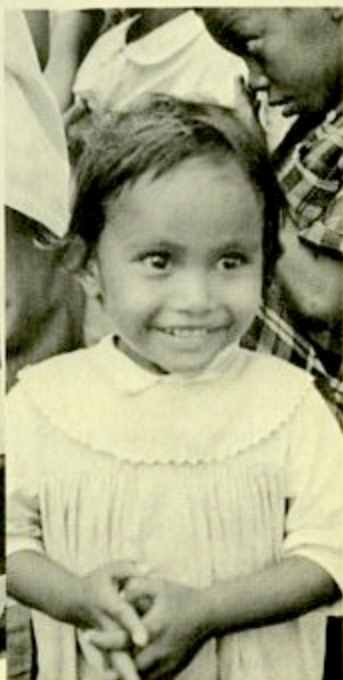
She hardly knows what it is all about.