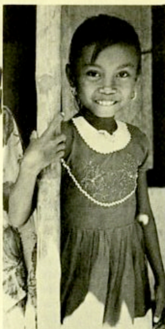
Her smile tells how happy she is.