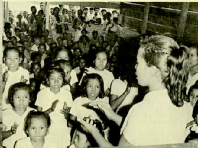
The whole village packed the primitive church.