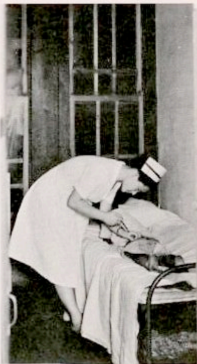
Shots hurt for a moment, but they help fight germs which harm little bodies.

The staff personnel of every Compassion orphanage are vitally concerned about the physical welfare of the children. Regular physical examinations, vitamins, antibiotics, and other forms of professional medical care are all a part of Compassion's extensive health program.