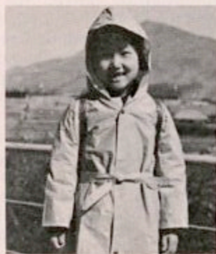
The sponsor of this happy boy sent a cash gift last year which was used to buy him a raincoat.