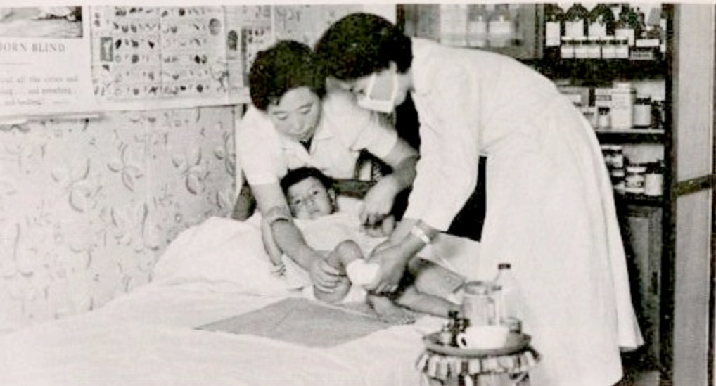
Registered nurses staff, well-equipped infirmaries in many Compassion orphanages. Every effort is made to provide sound medical care for all the children in the orphanages.