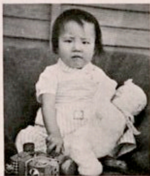
This darling little girl was thrilled with toys received from her sponsor last Christmas.

Why not take care of your Christmas gift today in order to be certain it does not arrive late? Please help us, the Korea office, and the orphanage superintendents by sending your gifts early—today if possible.