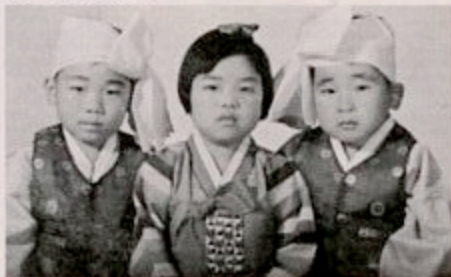
"These darlings will thrill you with their cute performance."