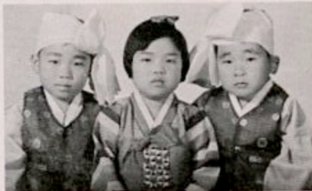
"These darlings will thrill you with their cute performance."