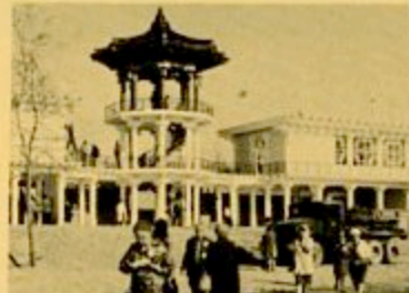
See Freedom House in Demilitarized Zone.