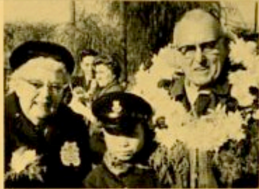
Receive a royal welcome from your orphan.