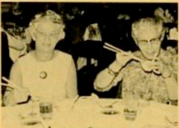
Eat Oriental foods with chopsticks.