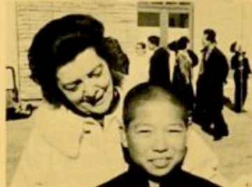
Put a big smile on your child's face.