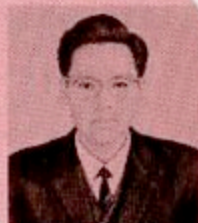
#1608 Chung Sool